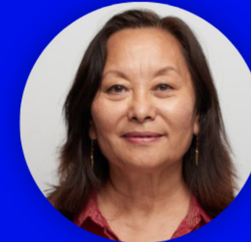
Yanki Tshering Spirit of Entrepreneurship Award