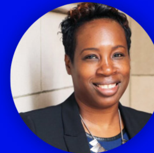
Dr. Alethea Taylor Neighborhood Leadership Award