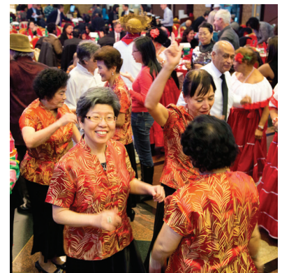
GRAND STREET SETTLEMENT

hours required to get ahead in this intensely competitive city. But it also frequently exists because of other, grimmer reasons – e.g., because those parents are in prison, are drug-addicted or dead, have abandoned their families, or are deemed by the state to be incapable of carrying out their parental responsibilities.