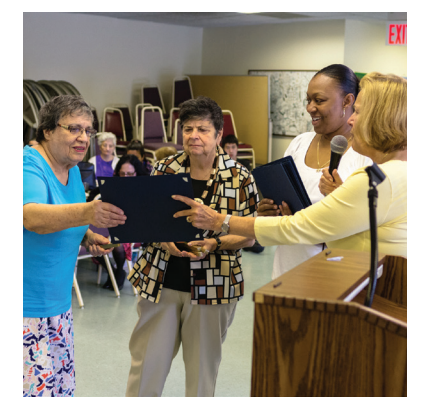
QUEENS COMMUNITY HOUSE

sion, diabetes, heart conditions – caused or exacerbated by lifelong lack of access to the core resources of health. The experts in the field described a range of programs that are successfully offering low-income older women information, exercise options, and nutrition tailored to their tastes, and that are, thereby, measurably increasing those women's overall health and wellbeing.