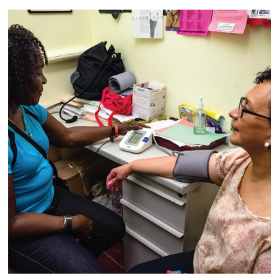
QUEENS COMMUNITY HOUSE

disparities in rates between white women and black and Latina women grow even larger.<sup>16</sup>