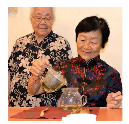
GRAND STREET SETTLEMENT

providers, and approaches. Regardless of whether they were discussing programs in which older Latinas coach medical students in indigenous health practices, older women plan and tend urban farms, or older women and their home care workers come together to seek wage increases for those workers, the core themes of those experts' remarks remained consistent.