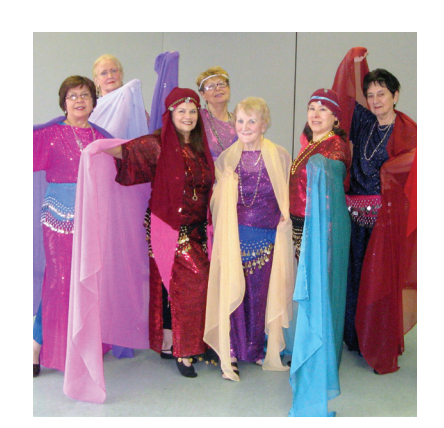
QUEENS COMMUNITY HOUSE

that "women-run micro-enterprise businesses" and other community providers in the fields of – for example – transportation, house cleaning and repair, or personal grooming find ways to offer those services at low cost to women who can no longer easily negotiate these tasks themselves.