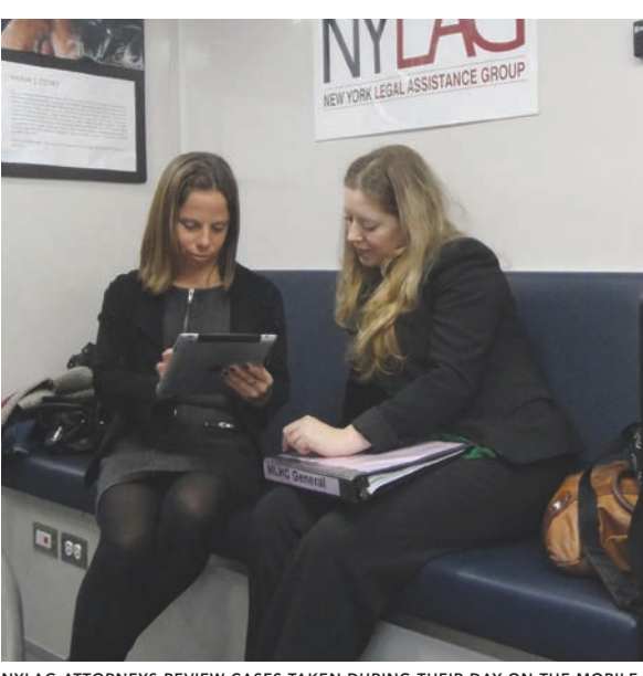
NYLAG ATTORNEYS REVIEW CASES TAKEN DURING THEIR DAY ON THE MOBILE LEGAL HELP CENTER, A LEGAL SERVICES OFFICE AND COURTROOM ON WHEELS.

funds not only to support under-resourced communities, but to ultimately influence and shift the systemic structures that perpetuate the cycle of vulnerability. Investment grounded in a gender lens advances our capacity to look differently at chronic social problems, particularly those that disproportionately affect women and gender fluid individuals.