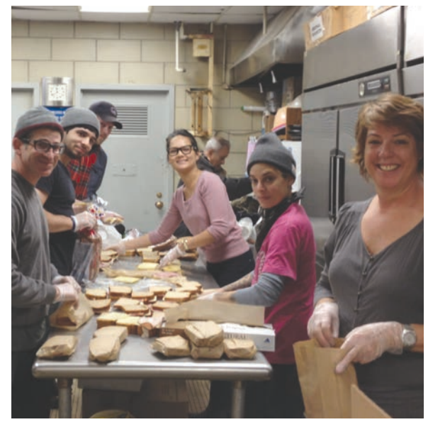
THINK COFFEE AND KELLY FROM GRAND STREET SETTLEMENT.

and communities. These groups had significant needs before the storm and continued to struggle and fall further down the economic ladder, as more resilient and well-resourced areas of the city regained stability. Using this perspective as a guidepost, NYWF developed focus areas that supported the shortterm relief and long-term recovery needs of women while also addressing the systemic context in which inequities are perpetuated.