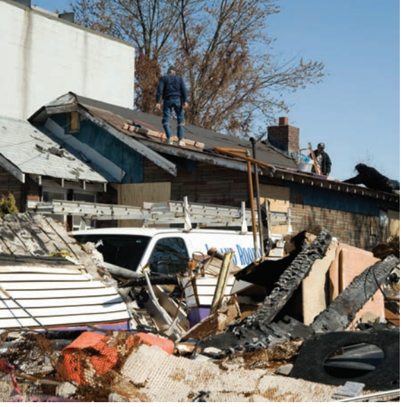
MIDLAND BEACH AFTER THE STORM.

Women are often disproportionately affected by disasters and face greater risks to their safety and health during and after a crisis. Women are more likely to live in poverty than men and consequently are more isolated from relief and recovery resources, health care, transportation, and housing in the face of storm