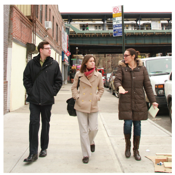
LAW STUDENT VOLUNTEERS FROM NYLAG ON THEIR WAY TO SURVEY THE DAMAGE TO A HOME IN BRIGHTON BEACH.

Grantee partners effectively pivoted service models to meet emerging community needs following Sandy. Many organizations had never supported disaster relief and improvised strategies to quickly address local challenges alongside other neighborhood partners. Embedded in their communities, community based organizations have the unique strength of responding flexibly and nimbly to crises, which larger institutions and government agencies are less able to provide. The capacity to evolve service delivery was relevant in the second year of the initiative as relief needs began to wane and the importance of addressing long-term recovery needs became increasingly evident. Grantee partners used learnings gained through relief work to inform planning and to identify priorities for community driven recovery efforts.