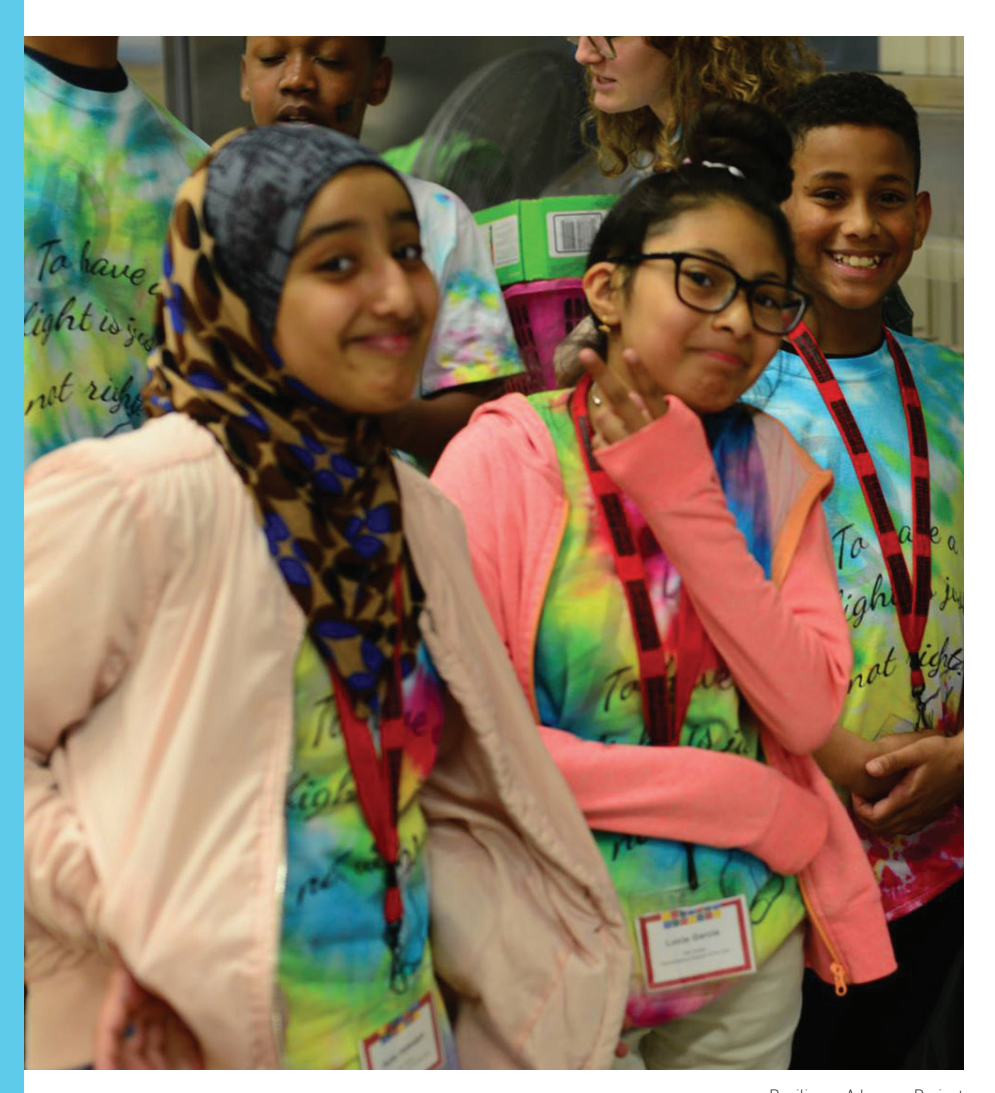
Resilience Advocacy Project