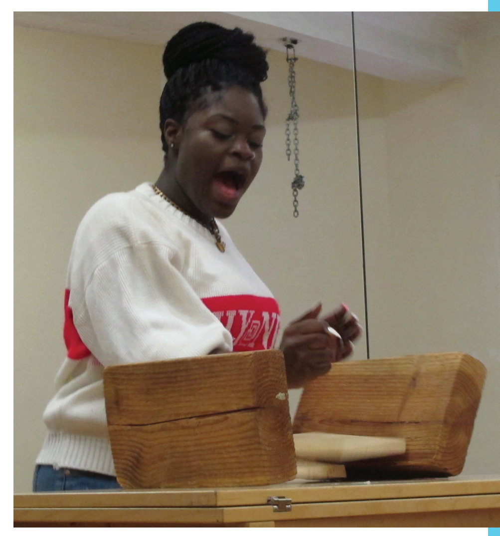
Center For Anti-Violence Education