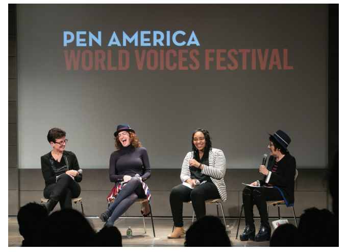
PEN America Panel

bringing together experts in the literary world and grantee partner leaders.