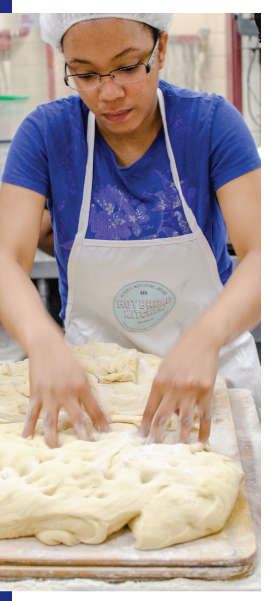
Hot Bread Kitchen