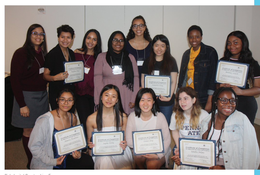
Girls Ignite! Grantmaking Expo

We granted $80,000 to the YWCA of New York City to facilitate and oversee the partnership.