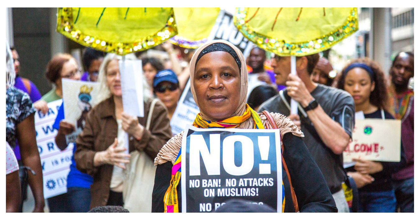
Grantee partner African Communities Together