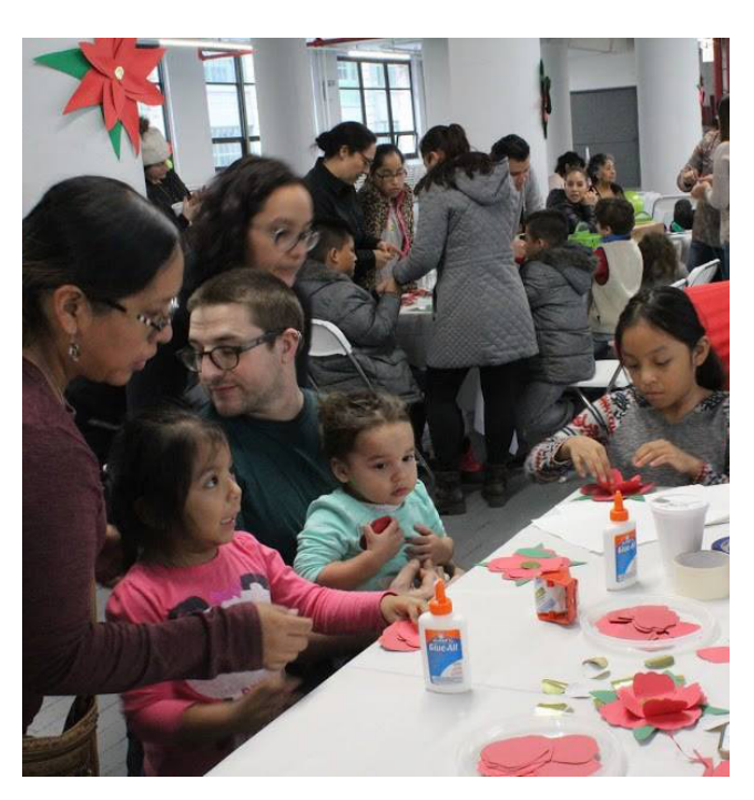
Grantee partner Mixteca

Jews for Racial and Economic Justice (JFREJ) - $60,000