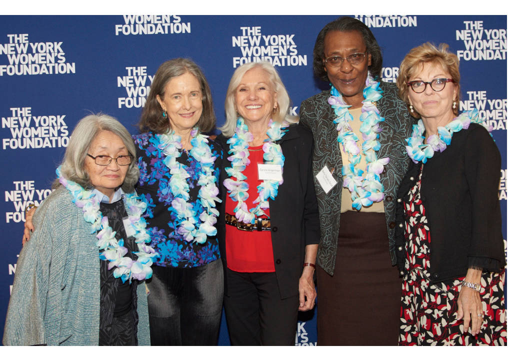
Board Alumnae at our 30th Anniversary Celebrating Women Breakfast

While some might characterize our bold early investment strategy as risk-taking, we don't see it that way because of our confidence in local leaders who have solutions to local problems.