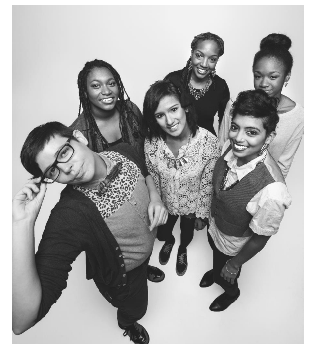
Grantee Partner: Girls for Gender Equity

This partnership has inspired a growing set of stakeholders including philanthropic institutions, community activists, governmental partners, and others. It has accelerated an urgent city-wide conversation about the structural inequities facing the city's young people and leverages new resources, expertise and wisdom across the five boroughs to ensure that young women and TGNC youth of color have every opportunity to thrive and take their rightful place as key actors in our families, our communities and our city at large. Together, The Fund works to accomplish more than any one of us can do alone.