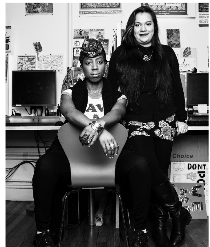
Grantee Partner: The Audre Lorde Project

Arab American Association of New York Arab American Family Support Center FIFRCF National Asian Pacific American Women's Forum South Asian Youth Action Sylvia Rivera Law Project Girls for Gender Equity Ancient Song Doula Services Atlas: DIY Black Alliance for Just Immigration Black Women's Blueprint CAAAV: Organizing Asian Communities Casita Maria Center for Arts & Education Community Connections for Youth, Inc. CONNECT, Inc. DRUM - Desis Rising Up & Moving Hetrick-Martin Institute Make the Road New York New York City Anti-Violence Project Resilience Advocacy Project Sadie Nash Leadership Project S.O.U.L. Sisters Leadership Collective The Alex House Project, Inc The Audre Lorde Project, Inc. The Brotherhood/Sister Sol Turning Point for Women and Families Welfare Rights Initiative